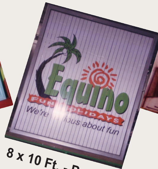
8 x 10 Ft. - Pune