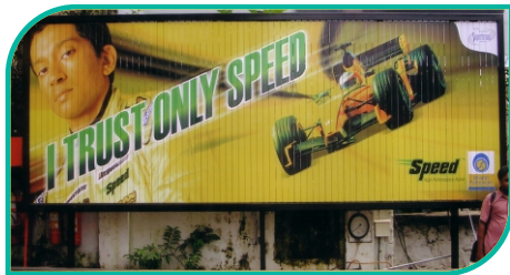
27 x 12 Feet - Mumbai