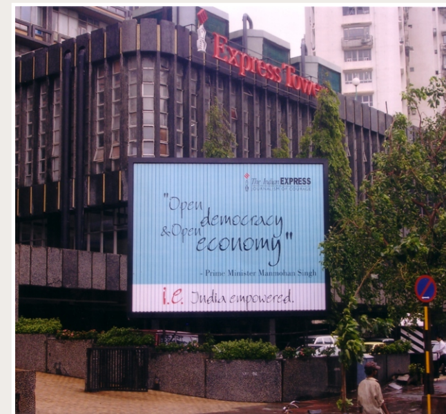
3 Faces of 20 x 15 Ft. at Nariman Point, Mumbai.