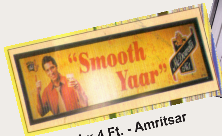
14 x 4 Ft. - Amritsar