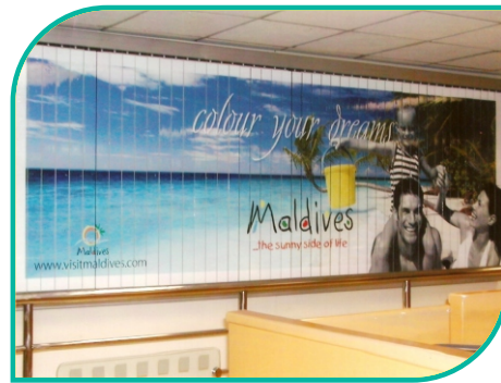
12 x 4 Feet - Colombo