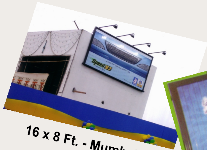
16 x 8 Ft. - Mumbai