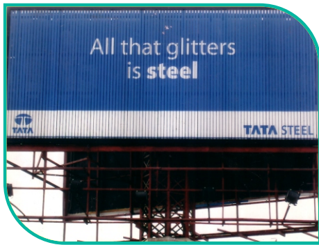
40 x 16 Feet - Kolkata