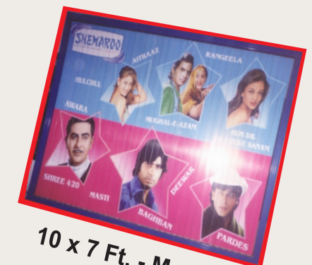
10 x 7 Ft. - Mumbai