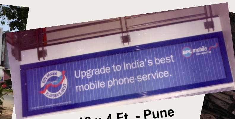
12 x 4 Ft. - Pune