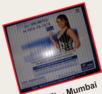
8 x 8 Ft. - Mumbai