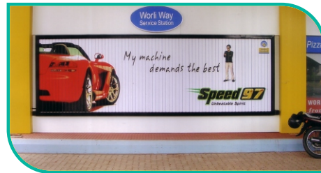
18 x 6 Feet - Mumbai