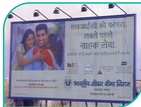
20 x 10 Feet - Bhopal