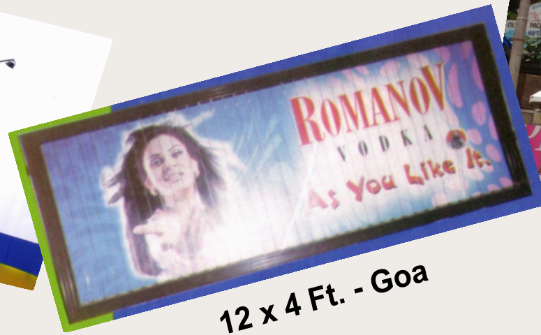
12 x 4 Ft. - Goa