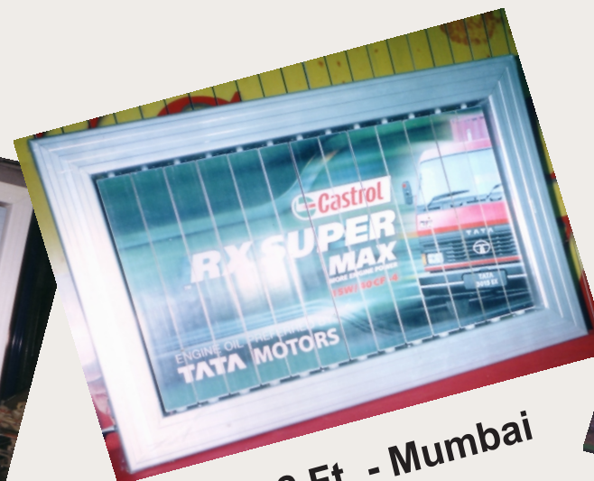
3 x 2 Ft. - Mumbai