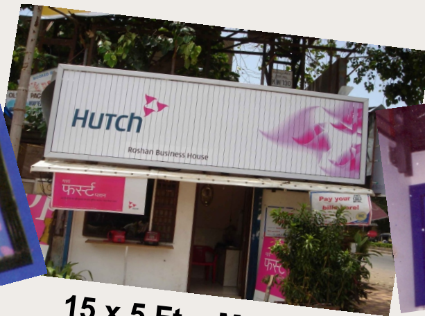
15 x 5 Ft. - Mumbai