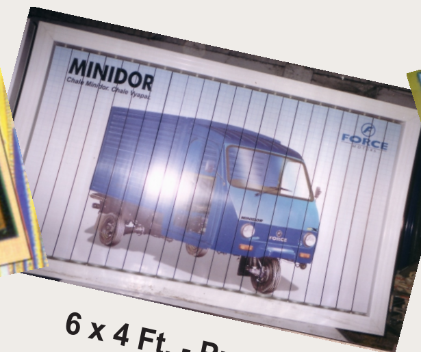
6 x 4 Ft. - Pune