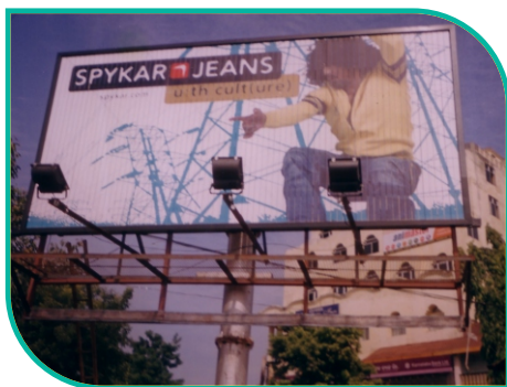
20 x 10 Feet - Bhubaneswar